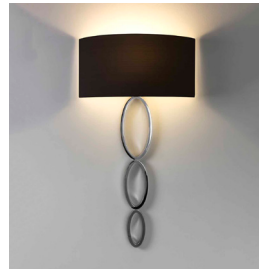
CODE: 1356001 (7396) FINISH: POLISHED CHROME