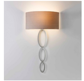
CODE: 1356003 (7398) FINISH: MATT NICKEL