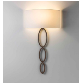
CODE: 1356007 (8261) FINISH: BRONZE

TO MAINTAIN THIS PRODUCT TO ITS BEST CONDITION, PLEASE VIEW OUR CARE AND CLEANING GUIDE ON THE SUPPORT SECTION OF THE ASTRO WEBSITE.